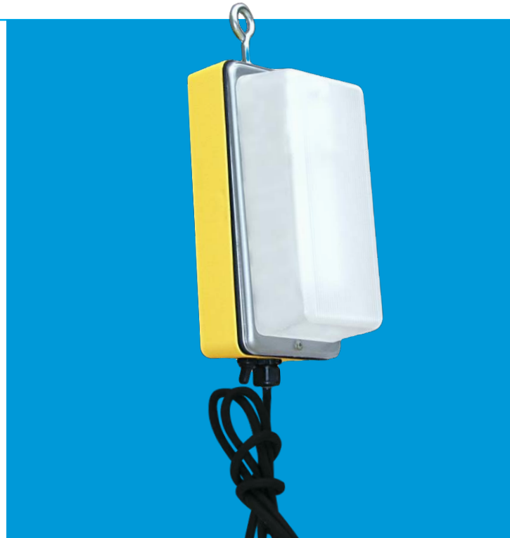
Model Number 30-WL-42-PLT

Luminaire Type _____ Catalog Number _____ Job Name _____ Approval _____