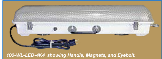
100-WL-LED-4K4 showing Handle, Magnets, and Eyebolt.