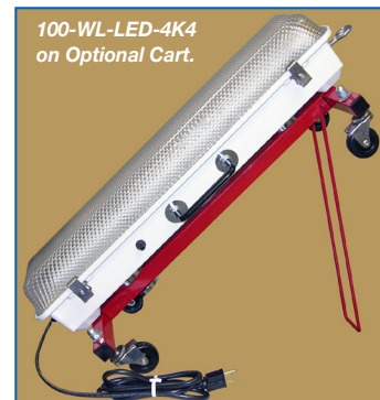
100-WL-LED-4K4 on Optional Cart.

Latches: Standard are two pairs of stainless steel suitcase style latches that secure a positive seal between housing, gasket and lens. Ideal for marine or other damp location applications. Also available are latches of white Celcon or polycarbonate materials. Special tamperproof latches are available as a custom component in stainless steel or polycarbonate.