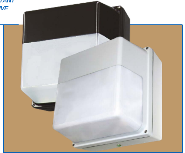
Non-emergency and emergency versions allow continuity of aesthetics in multiple luminaire installations.

Luminaire Type _____ Catalog Number _____ Product Code _____ Job Name _____ Approval _____