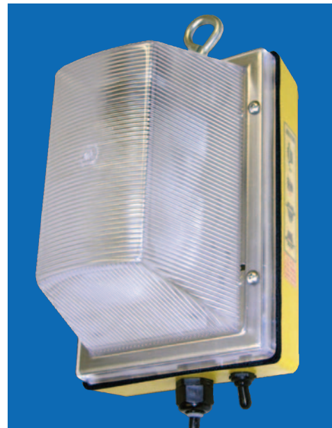
MODEL 300 LED WORKLIGHT