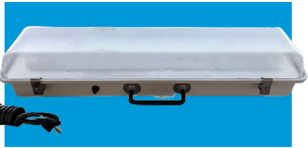
Worklight on Optional Cart

Energy-saving illumination for task lighting. Vacuum-formed polycarbonate clear prismatic lens interior is engineered for maximum light control and diffusion; smooth exterior allows ease of cleaning; and rounded corners for additional impact strength and user safety. Housing is rigid one-piece construction, compression-molded fiberglass reinforced polyester. Continuous poured-in-place gasket completely fills the perimeter channel of the housing and snugly accepts lens flange for maximum seal integrity against moisture and dust. Oil/water-resistant 6' 18 AWG SJTOW black cord, three-prong NEMA 5-15 plug, and strain-relief cord fitting. Two 3 1/4" magnets (rated pull strength of 90 lbs. each) for beam support and 3/4" eyebolt, integral to the fixture, for overhead support by safety chain (not included). Water-resistant switch, zinc-plated steel handle with