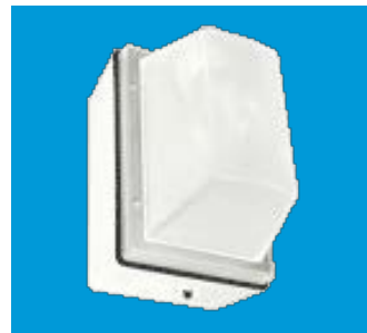
Shown With Clear Prismatic Lens