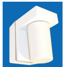
Shown With Optional Housing